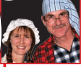
Mama (in her kerchief) and I (in my cap)

(yeah, special store bought cookies glued to a cookie sheet)