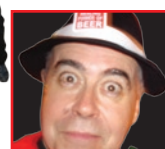
Anonymous beer drinker