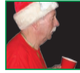
Food Pantry Volunteer

Just so you know, I had this lampshade on my head when I got here, ok?