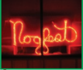
Mr. Rope Light Sign

A: They outgrew the previous venue several years ago, so now Nog•fest is held at a warehouse in the Nog district. Just look for me. The address is 2306 Vondron Road, Madison, WI. (see map on other side.)