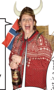
they even have nutmeg!

I can answer that question! They have many varieties of Good beer! (not just that light stuff), PLUS soda, water and my favorite - Egg Nog! They even have brandy and rum to add too!