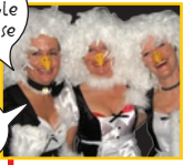
Three French Hens