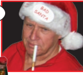
Bad, Bad Santa

A: Is that all anyone cares about these days? Gimme gimme gimme..that's all I hear, and I'm really sick of it! If you want to receive a $6 (perceived value) gift, well then, by gosh, ya gotta bring one. I guess they refer to this as the optional gift exchange.